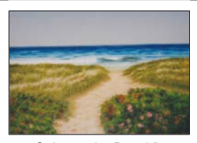
"Going to the Beach" Pat DeMarco

Displayed are some of the paintings that were part of the raffle.