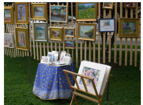
Great art work. A lovely display!